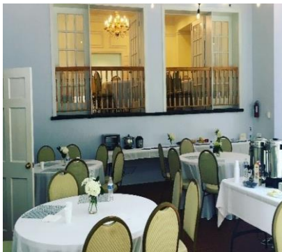
Dining in Rapidan Room