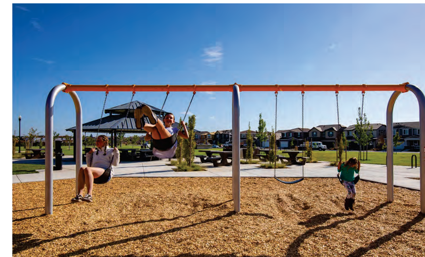
C Swing structure with 2 belt swings, 1 bucket swing, and 1 harness swing (Ages 2-12 yrs.)