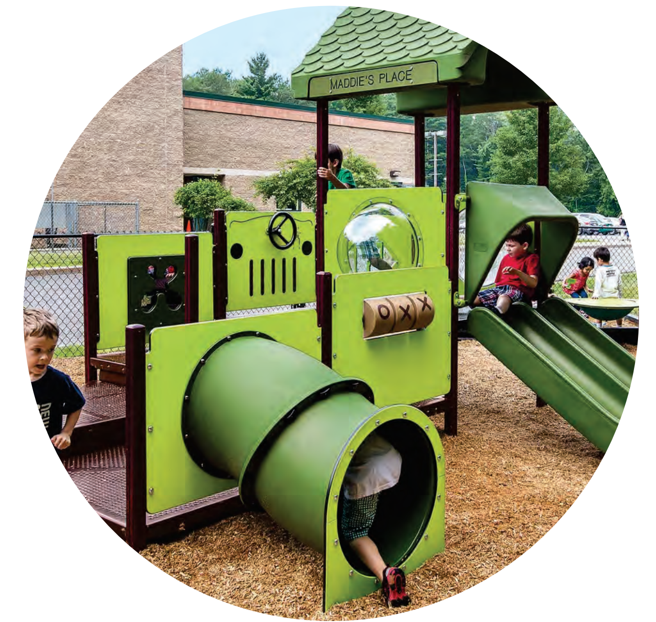
D Playshaper structure with climbers, double slide, ladder, crawl tunnel, and mirror (Ages 2-5 yrs.)