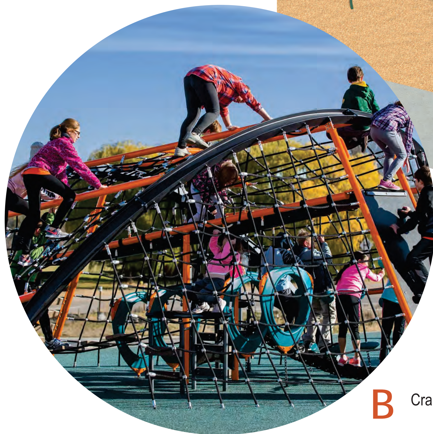
B Crab Trap structure (Ages 5-12 yrs.)