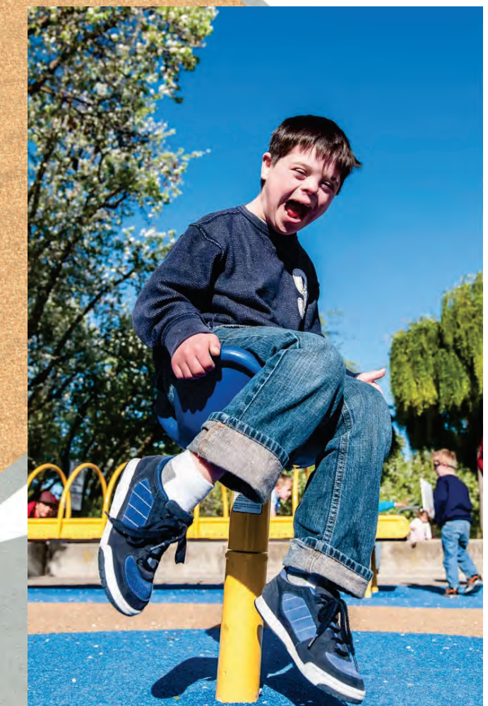
E Sitting spinner (Ages 2-12 yrs.)

Olney Mills Neighborhood Park Sparks@Play 007208OM-1-1 • 02.16.2023