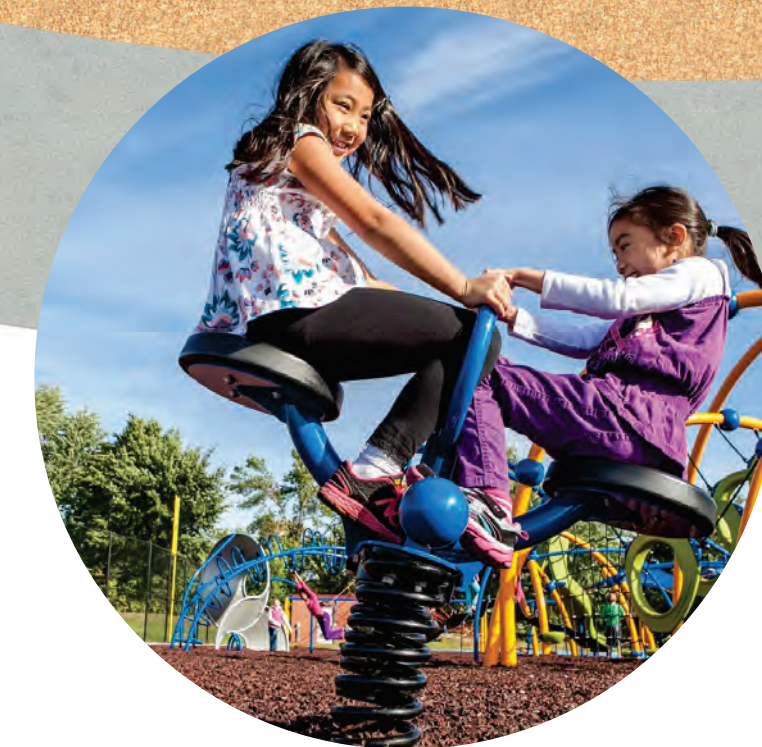
F Double spring rider (Ages 2-12 yrs.)