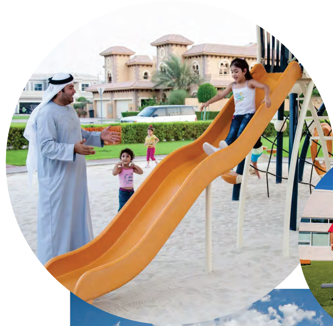
A Playbooster structure with slide, spring pods, twister, spinner, overhead climber, and balance beam (Ages 5-12 yrs.)