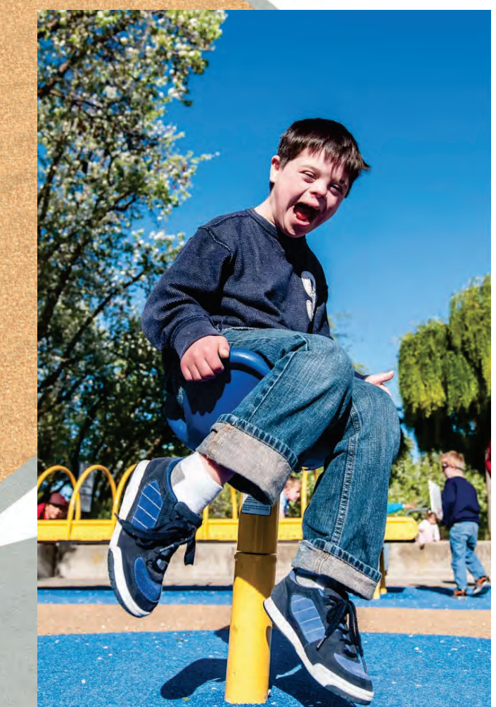
E Sitting spinner (Ages 2-12 yrs.)