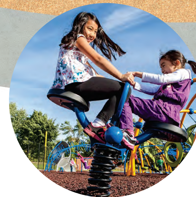
F Double spring rider (Ages 2-12 yrs.)