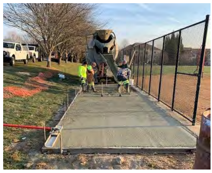
(Left) An example of a blue stone player's bench area that can be prone to weeds. (Right) A poured concrete player's bench area is installed at Fountain Hills Local Park to allow for easier maintenance.