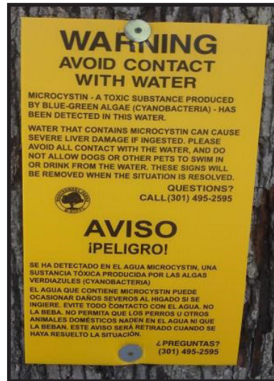
Look for and obey park signs.