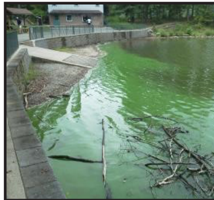
Cyanobacteria bloom near the Lake Needwood boathouse.