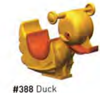
4/5. SPRING ROCKERS Ages: 2-5