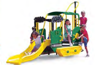
3. DOZER CLIMBER Ages 2-12 4 Ground-level activities