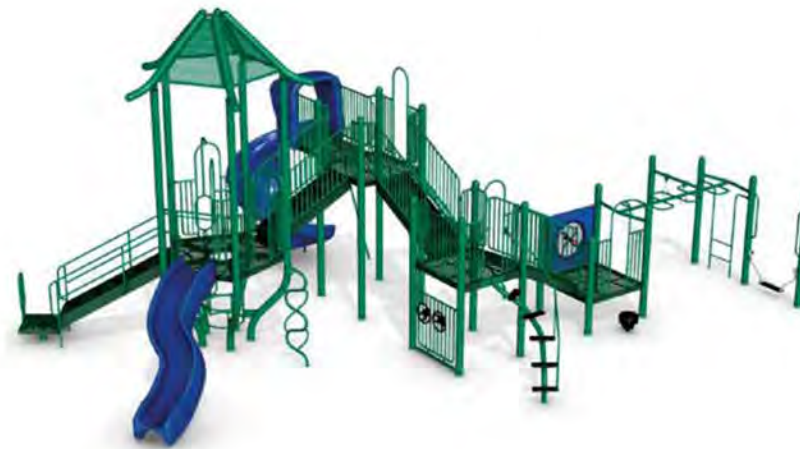
6. SCHOOL HOUSE COMPOSITE STRUCTURE Ages: 5-12 Activities: 9 elevated, 9 accessible, 4 ground level