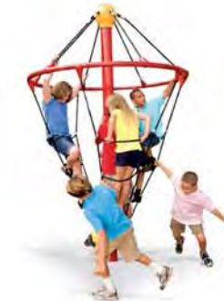
2. SPINNER AGES 5-12